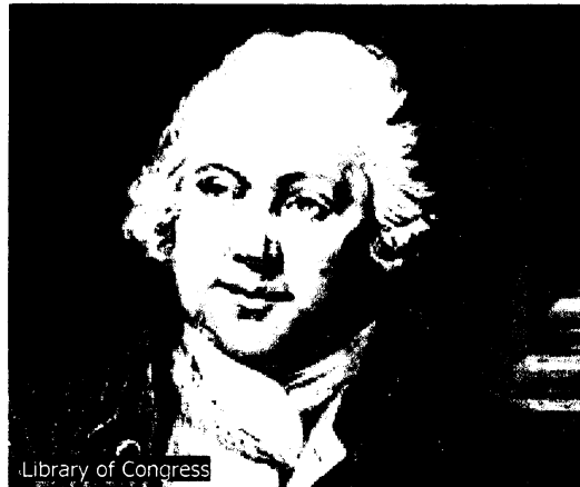
Sir Richard Arkwright, inventor and industrialist. He was originally from Preston.

Nature gradually healed the scars after the clearance of the buildings but the site was to remain derelict for over 40 years until the creation of the Yarrow Valley Country Park in the 1990's.